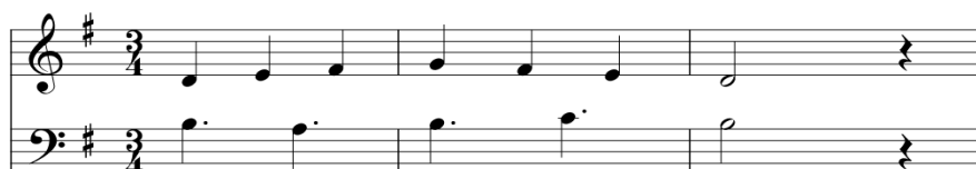
Example 1: Conjectural passage showing a 3:2 rhythmic relationship.

Over a span of almost 50 years, Nancarrow wrote 49 numbered “Studies” for the player piano. He used ratios in several different ways in these pieces, and many of his ideas—particularly the earlier ones—are obviously influenced by the ideas of Henry Cowell as set forth in New Musical Resources of 1930 [3]. It was Cowell who first presented the idea of relating simultaneous tempos to acoustical pitch ratios found in musical intervals and chords. For instance, the interval ratio for the purely-tuned perfect fifth, 3:2, could be represented rhythmically in a passage such as shown in Example 1.