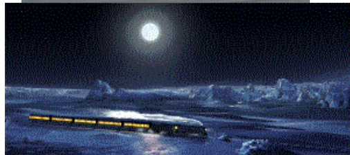
The Polar Express vs. The Space Express