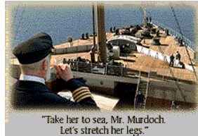
"Take her to sea, Mr. Murdoch. Let's stretch her legs."

(c) RMS Titanic was about 800 feet long (245 meters), with a mass of 40,900,000 kg (that would correspond to a displacement of about 45,000 tons), and according to the numbers painted on the bow of the ship, she was drafting about 37 feet (11.3 meters) — that means that 11.3 meters of the ship was below the water. Assume that the part of the ship under the water is a rectangular box with these dimensions — what is the width of this box — and hence the width of the ship? Should your calculation be too big or too small? Why?